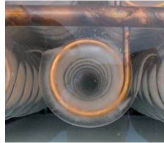
Ice Bear technology in London, Ontario: Large copper coils show how blocks of ice are frozen in tanks at night to cool the branch the next day