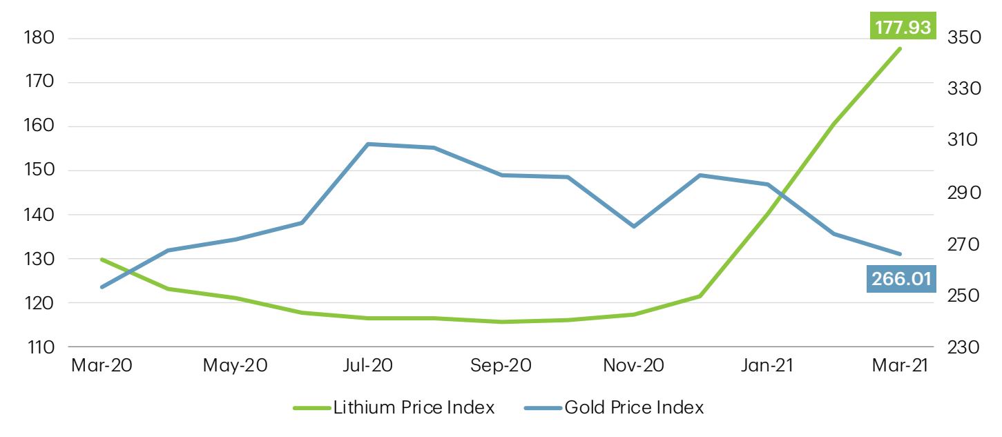
Exhibit 2: Lithium Price Index