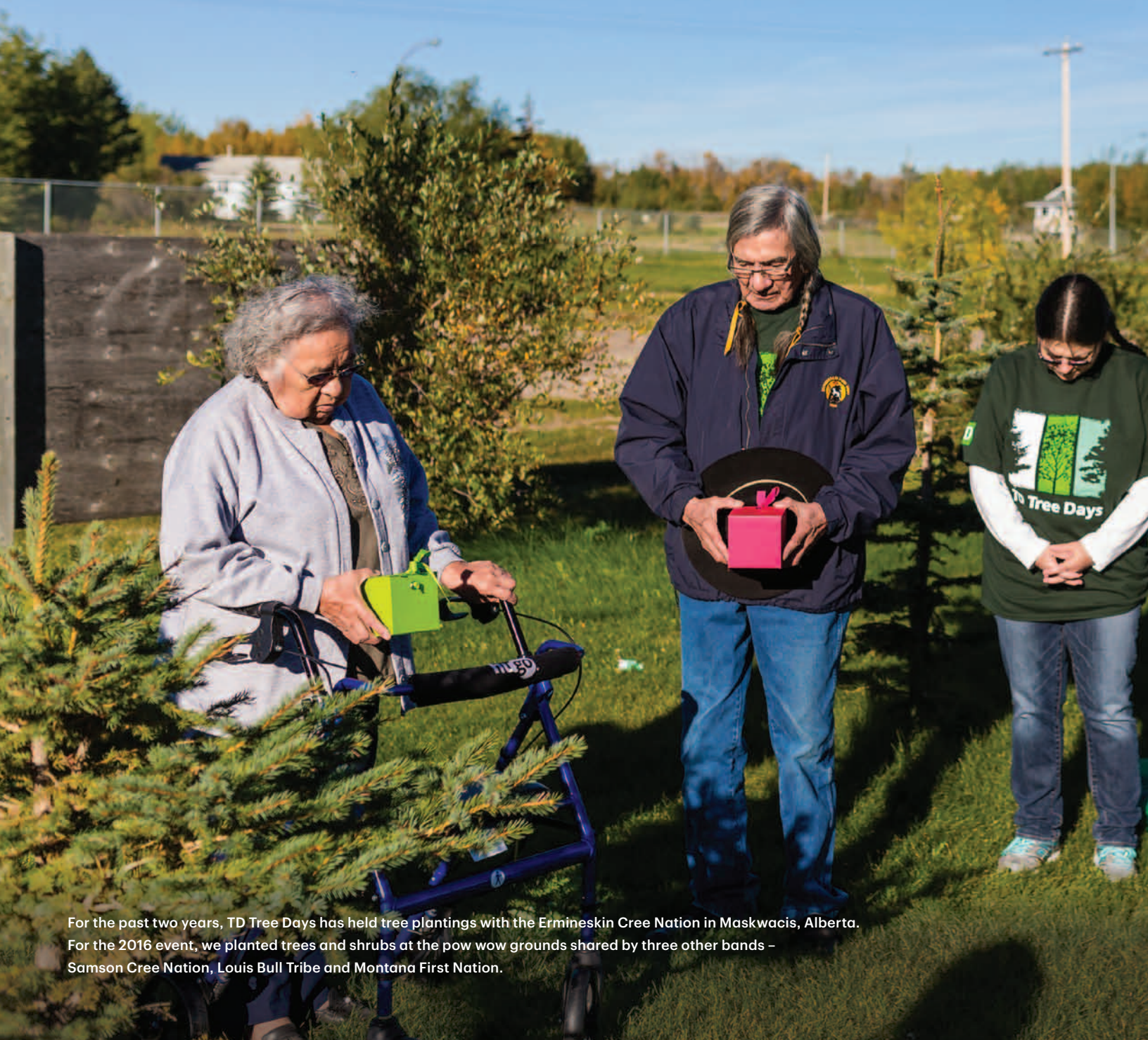
For the past two years, TD Tree Days has held tree plantings with the Ermineskin Cree Nation in Maskwacis, Alberta. For the 2016 event, we planted trees and shrubs at the pow wow grounds shared by three other bands – Samson Cree Nation, Louis Bull Tribe and Montana First Nation.

Building on TD's long history of partnering with Indigenous peoples and organizations, this report demonstrates how we are turning commitments into action to support Indigenous progress.