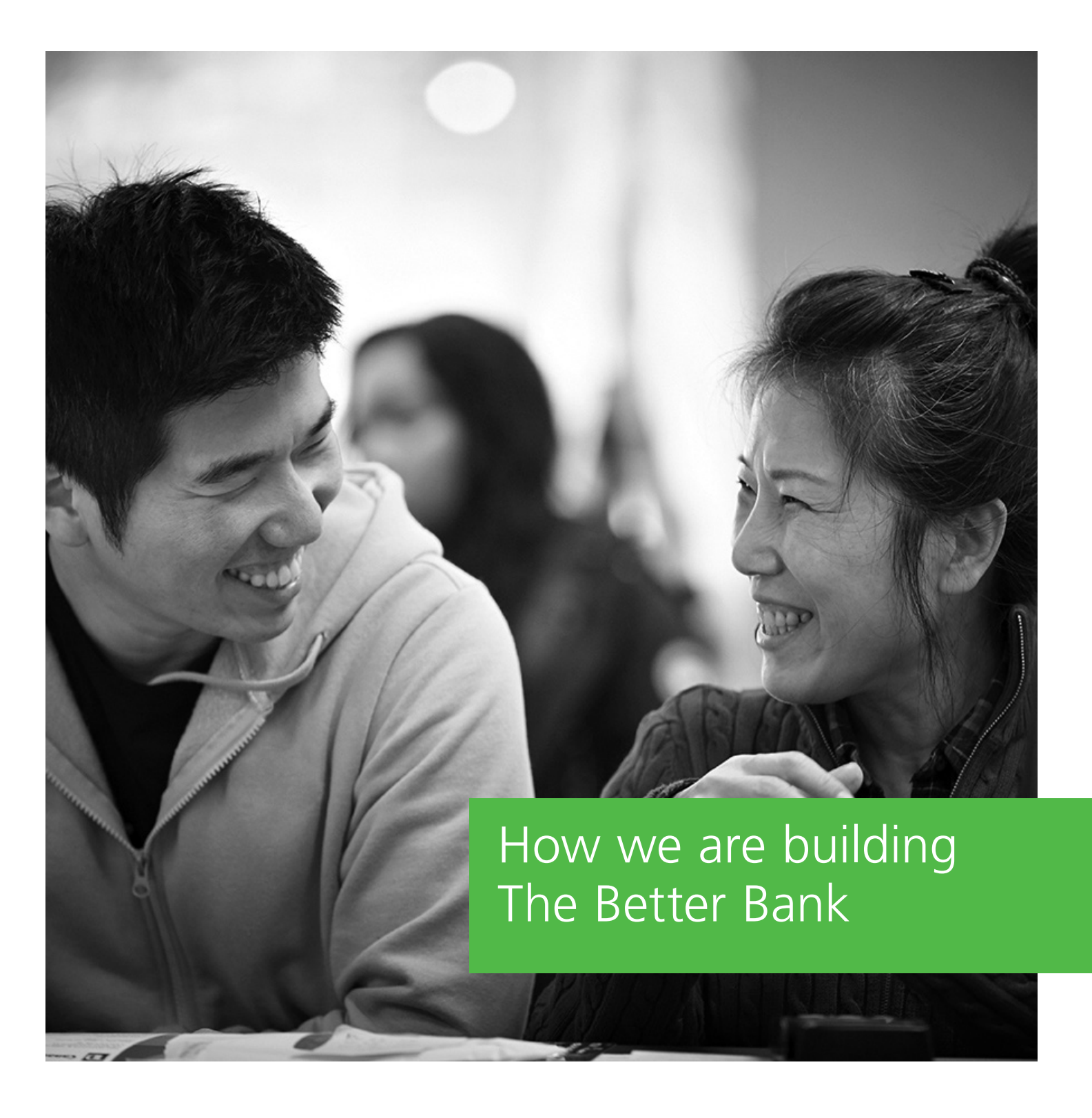
2014 Corporate Responsibility Report Executive Summary