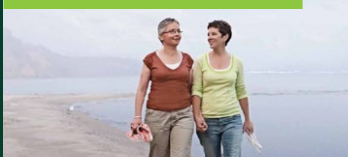
Employees from TD's LGBT community volunteered to "star" in our Wealth Management advertising campaign.