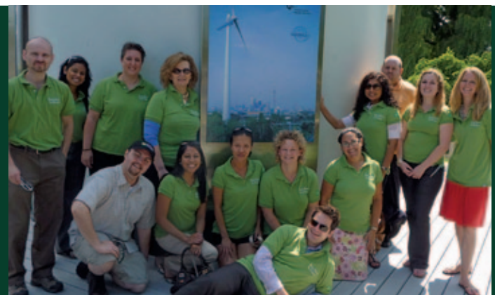
TD has over 60 Green Teams across Canada, and we're launching Green Teams for U.S. employees in 2011.