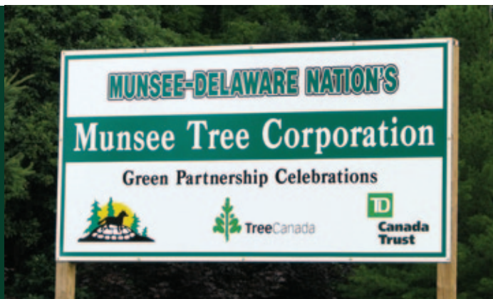
The Munsee-Delaware project helped create jobs in the green economy for First Nations youth.

TD Asset Management is a signatory to the United Nations Principles for Responsible Investing and offers three sustainability funds to retail and institutional investors.